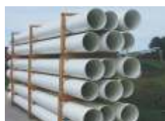
PVC Pipes & Profiles