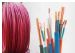
Wires & Cables