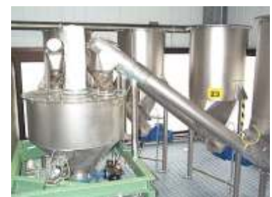
Multiple additives feeding and automatic weighing