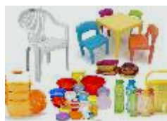
Household & White Goods