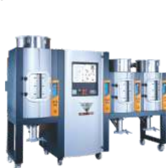
Dehumidified Air Dryer