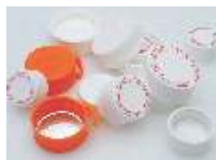
Caps & Closures