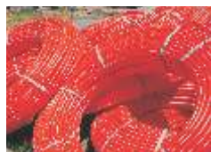
HDPE Pipes & Ducts