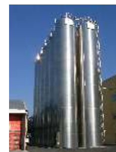
Silo with silo feeding system

Bulk Material Handling Systems for PVC and other Powdery material