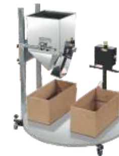
Parts Counting - Weighing