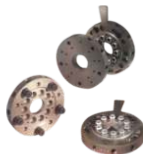
Quick Gripper System