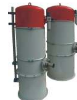
Powder conveying & weighing