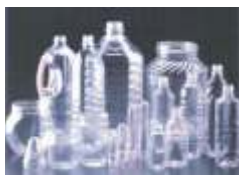
PET Preforms & Bottles