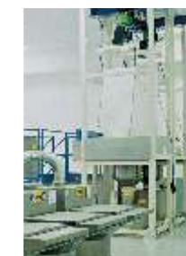
Small & Jumbo bag unloading system