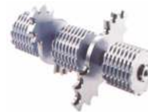
The Power of Slow Speed

Technical collaboration with MO.DI.TEC s.r.l. - France for Online Slow Speed Granulators