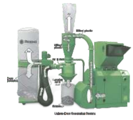
Complete Integrated Dust Separating System