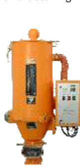
Hot Air Dryer