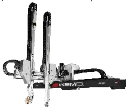
Servo Robot with two Vertical Arms