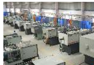
Central Conveying System