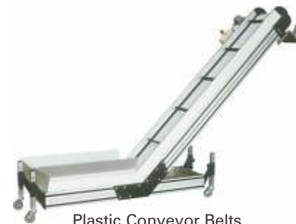
Plastic Conveyor Belts

A joint venture with Costruzioni Meccaniche Crizaf S.p.A. - Italy for Conveyor Belts and Part Handling System