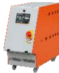
Mould Temperature Controller