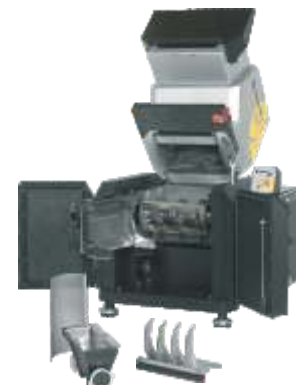
Open hearted concept for easy access

Technical collaboration with Rapid Granulator AB, Sweden for Granulators